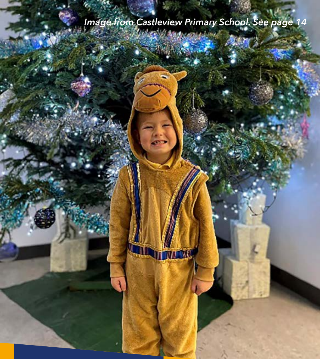
Image from Castleview Primary School. See page 14